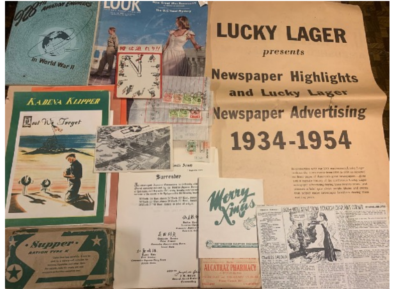
At right: World War II collage at MOAM deserves close inspection.

To find redemption in the action, and to silence some of the critics, see current pictures of the beautiful cities in Japan, after we forgave them and helped rebuild their country under the leadership of General Douglas MacArthur.