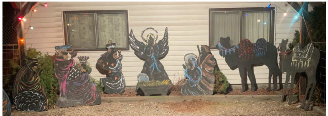
See the life-size Nativity scene beneath the canopy in front of the Museum.

For unto us a child is born, to us a son is given Isaiah 9:6